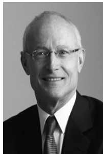
Michael E. Porter, Ph.D., age 66, Director of the Company since 2013

Committee Memberships: Strategy; Innovation (Chair)