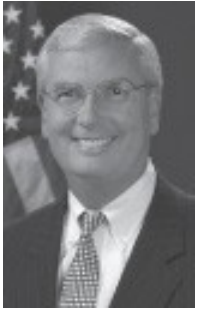
Stephen L. Johnson, age 62, Director of the Company since 2010

Mr. Johnson is the President and Chief Executive Officer of Stephen L. Johnson and Associates Strategic Consulting, LLC (“Johnson and Associates”), a strategic provider of business, research and financial management and consulting services formed in 2009. Prior to forming Johnson and Associates, Mr. Johnson worked for the U.S. Environmental Protection Agency for 30 years, where he became the first career employee and scientist to serve as Administrator, a position he held from January 2005 through January 2009. Mr. Johnson serves as a director of M2 Renewables, Inc., Ener-Core, Inc. and as a Trustee of Taylor University.